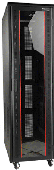
Width 600 Glass Door