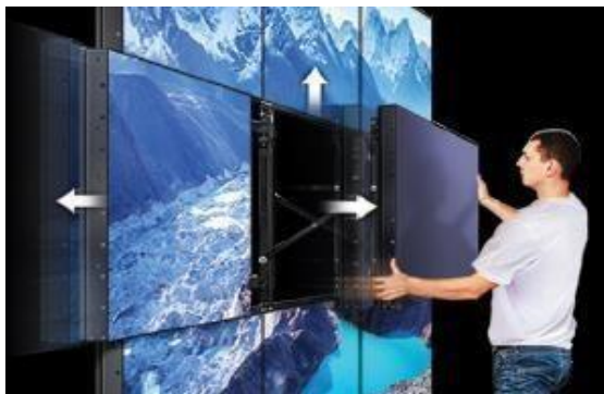
The rigid modular display frames interconnect and eliminate the need for manual bezel alignment.

This user friendly design of wall mount eliminates the tedious efforts required to measure and adjust the wall mount, allowing you to conceive ideal layouts through effortless alignment between the wall mount size and video display size. This dimensional consistency and easy adjustability also prevent the need to dismantle the entire video wall should one section require adjustment.